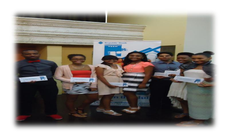
Most Vibrant Peer Helpers 2015